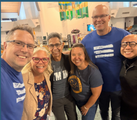
Church of St. Patrick, Sarasota, FL

Our Advent tour of The ONE Live Experience took us south this year. A few thousand miles traveled with three team members, a trailer, and lots of "road snacks" found us in Florida, in the cities of Osprey and Sarasota. From there we traveled to North Carolina for a combination of events in Wilmington and Hampstead. Not only did we meet amazing people, we saw the biggest impact on people's hearts that we have ever seen over the last sixteen years. The message of this event is changing lives in ways we couldn't have imagined.